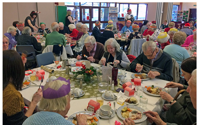
Christmas at ALL

Physical & Cognitive Vitality: Tailored exercise classes alongside craft and art sessions to keep bodies and minds sharp.